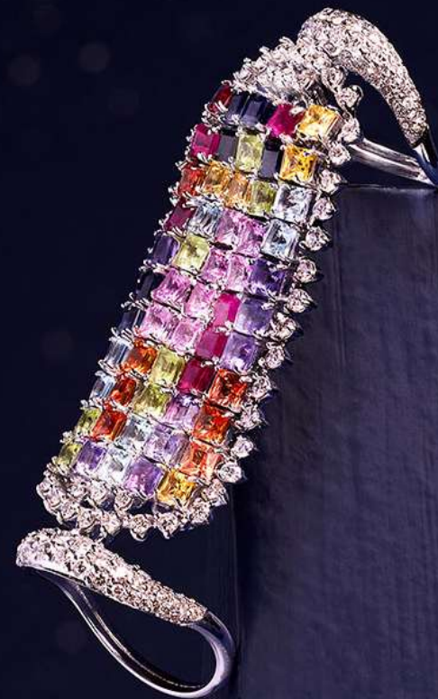
Designed by Sushil Bhalerao Manufactured by Tara Fine Jewels

The Splash of Rainbow midi ring created in white gold is carpeted with multicolour gemstones and is super flexible and sits on the wearer like a silken fabric. The ring is exclusive and fashionably ahead of its times, just like Wallis was.