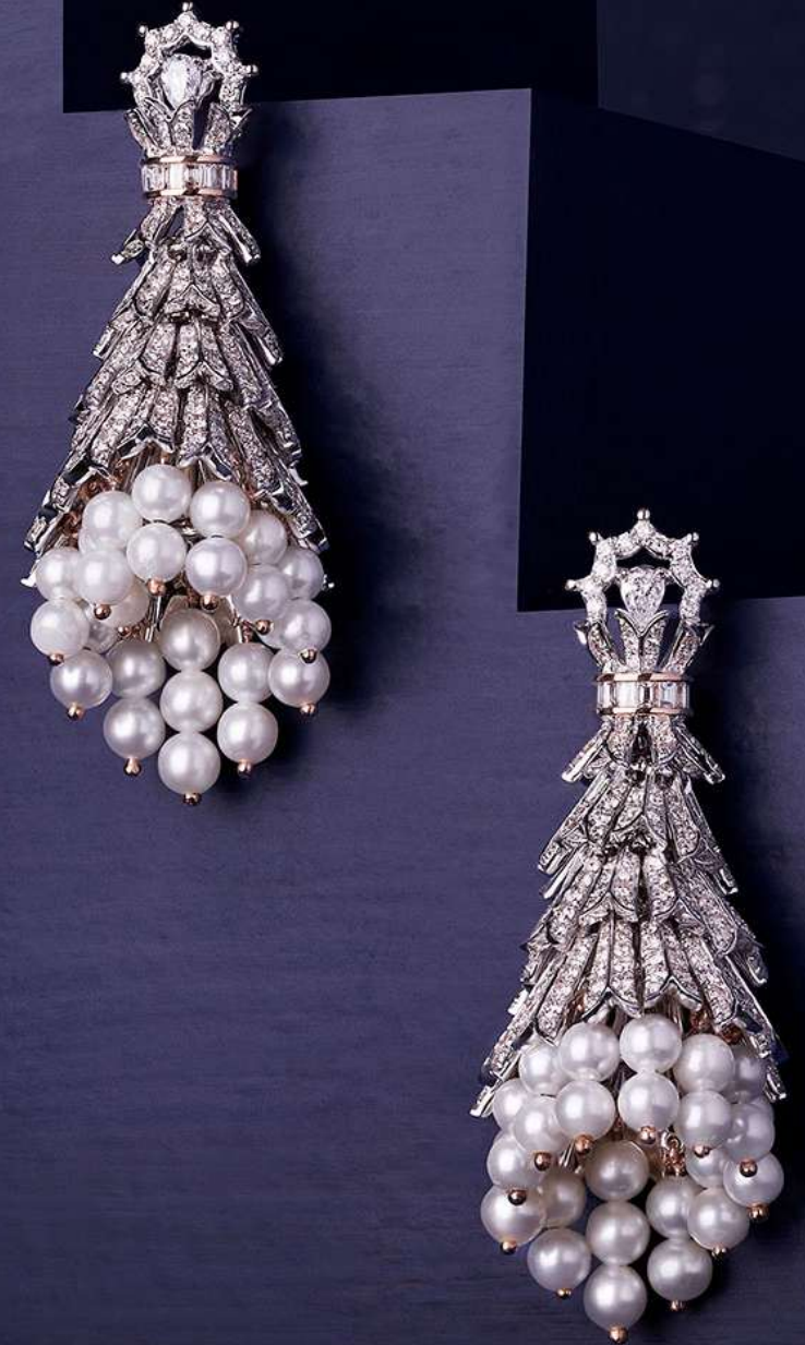
Designed by Dhananjay Dholam Manufactured by Romil Jewellery

The majestic Debutante Ball earrings spell refined elegance! The tiered earrings are ornamented with round and pear-cut diamonds set with graduating knife-edge microsetting layers ending with a profusion of pearls.