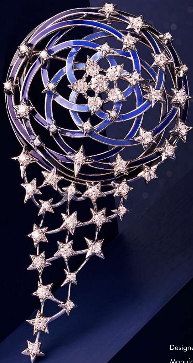
Designed by Deepa Kala Manufactured by Aura Jewels

The brooch Dance of the Venus is crafted with 18-karat white gold and represents the ballet between Venus and Earth in the form of blue enamelled orbits against the backdrop of the sky full of diamond stars.