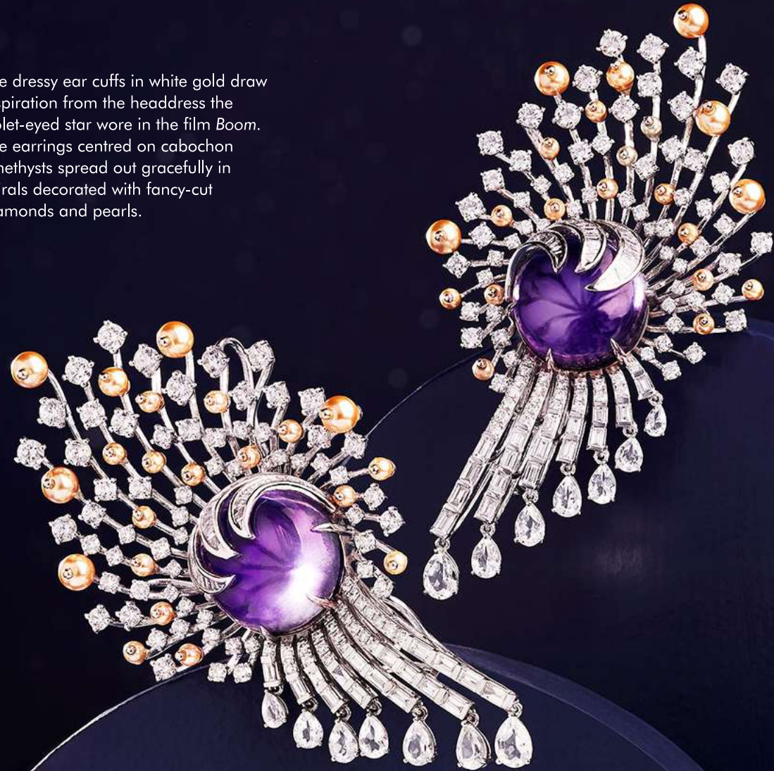
Designed by Khushali Desai Manufactured by EON Jewellery

The dressy ear cuffs in white gold draw inspiration from the headdress the violet-eyed star wore in the film Boom. The earrings centred on cabochon amethysts spread out gracefully in spirals decorated with fancy-cut diamonds and pearls.