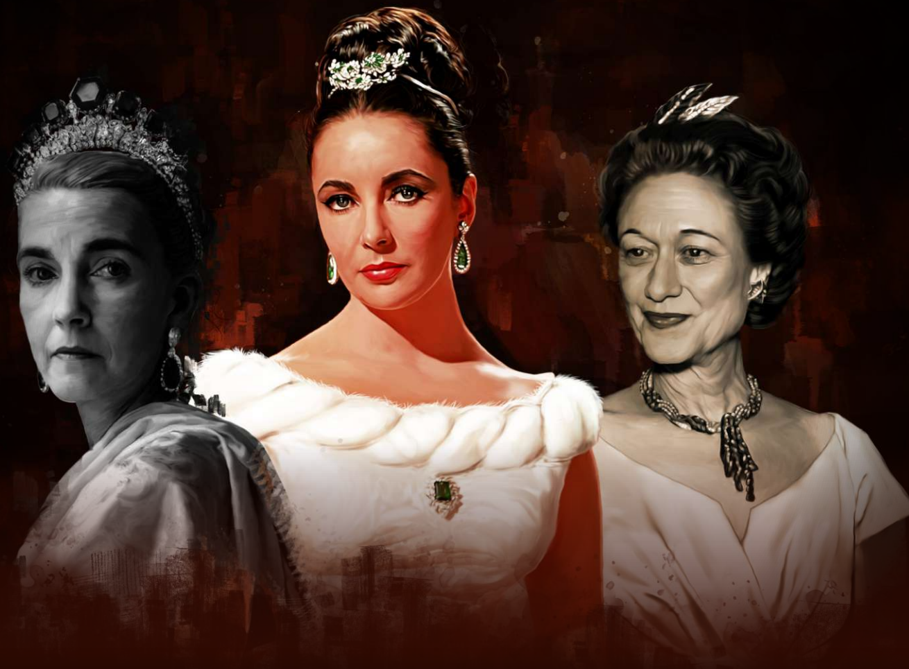
BARBARA HUTTON | ELIZABETH TAYLOR | WALLIS SIMPSON